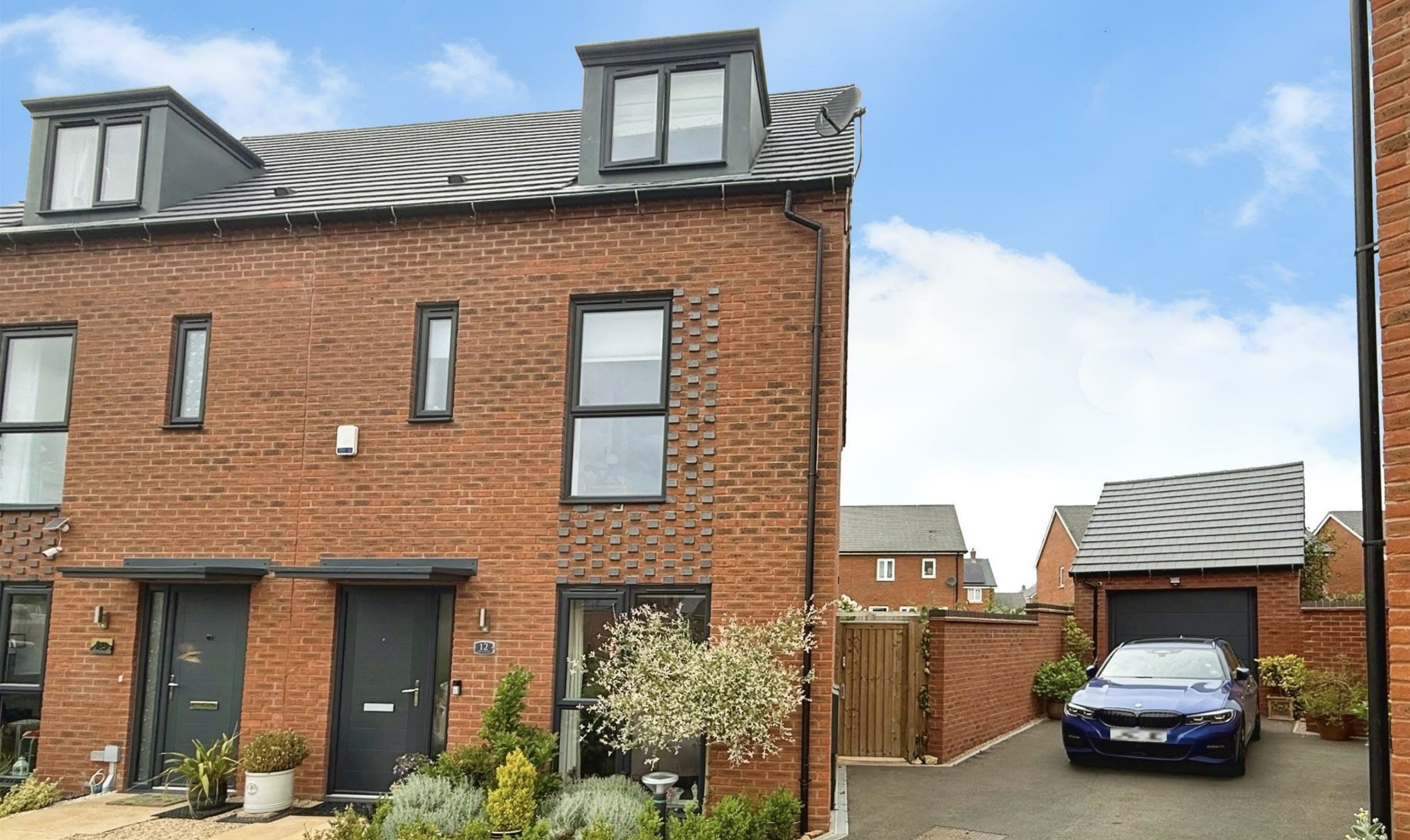
Larch Road , Meon Vale Stratford-upon-Avon, CV37 8FN